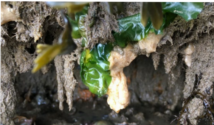
The Carpet Sea Squirt, Didemnum vexillum , is a highly invasive species that poses a threat to native species.

Through experiments in the lab, Ecostructure researchers have been trying to understand the role of genetics in the variable success of several invasions of the carpet sea squirt around the Irish Sea. They aim to better understand what makes some new colonies more successful than others by testing the response of different populations to environmental stressors like marine heatwaves. This will have implications for understanding the potential for this species to continue spreading under climate change, where marine heatwaves will become more prevalent.